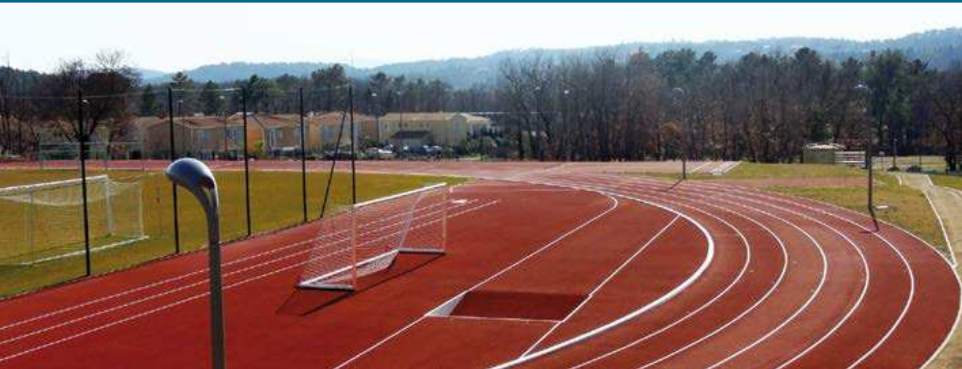
E - 700