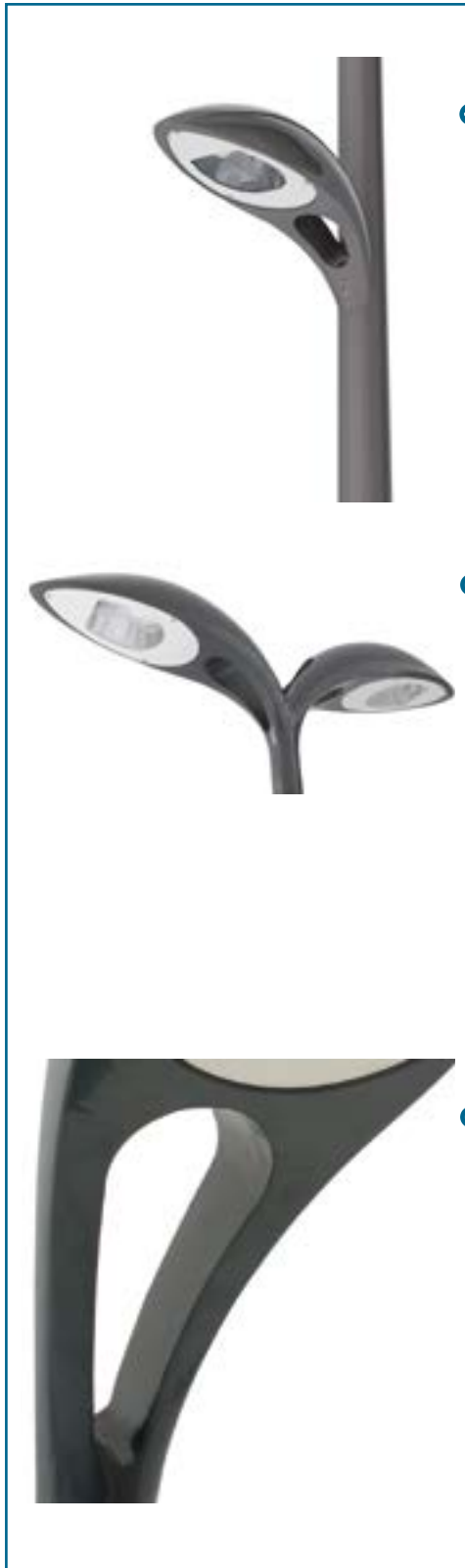
+ Mounted on pole