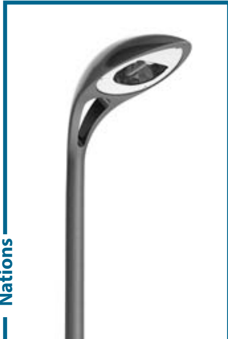
Suggestions for assembly