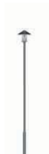
Sylésis Suggestions for ensembles