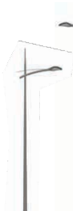
B - Jima 600