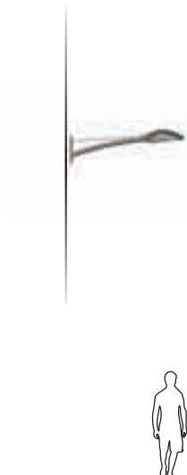
A - Wall mounting