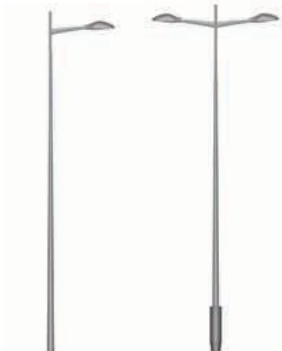
B - Kima 800