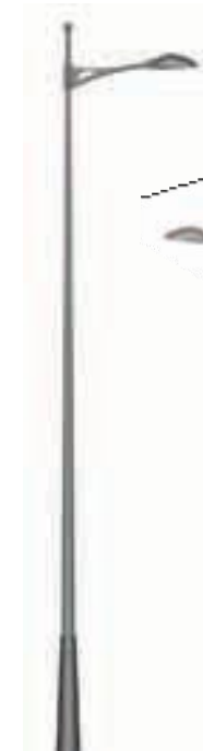
D - Kima 800 Duna bollard