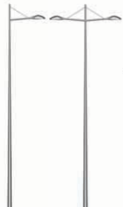
C - Kima 800