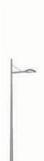
B - Kima 500