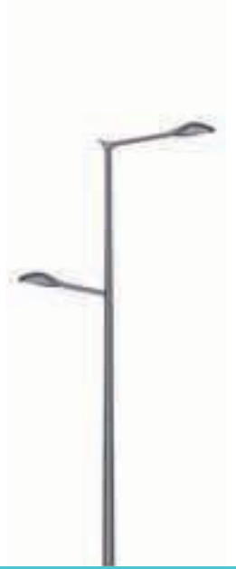
D - Java 600