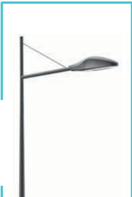
R-Light Suggestions for ensembles