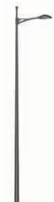
C - Java 800