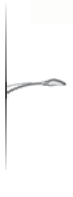
A - Wall mounting