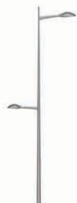
D - Kima 800