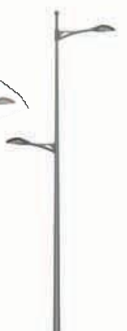
F - Kima 800