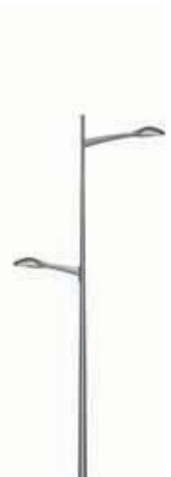
D - Jima 600