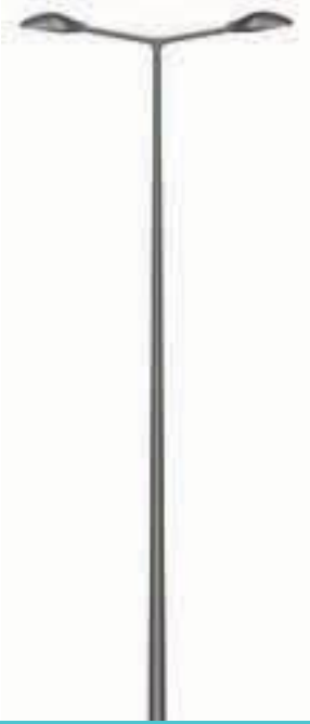
C - Java 800