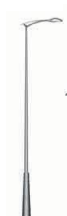
D - Kima 800 Duna bollard