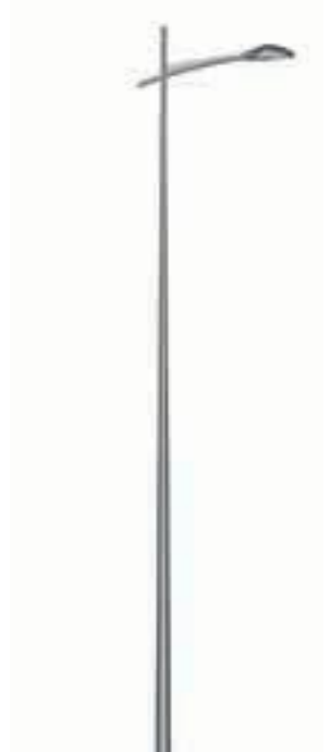
B - Jima800