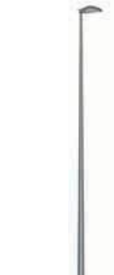
D - Jima 700