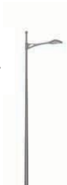
B - Kima 600