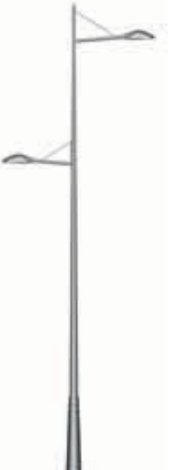
D - Kima 800