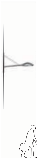
A - Wall mounting