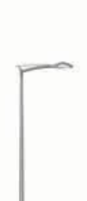
B - Kima 600