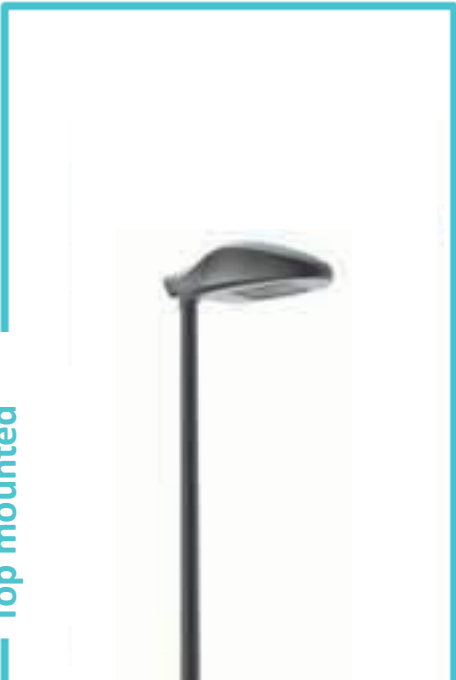
R-Light Suggestions for ensembles