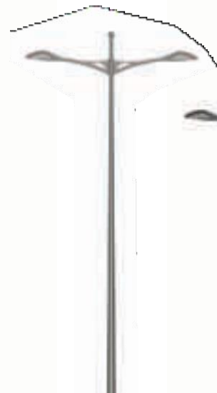
E - Kima 600