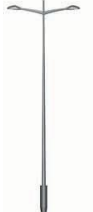
C - Kima 800 Cannelia bollard