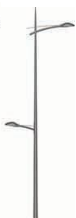
E - Kima 800