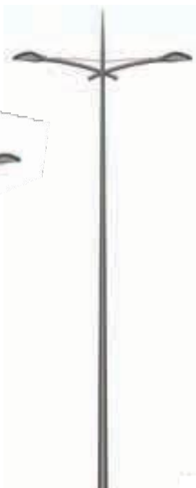
C - Kima 800