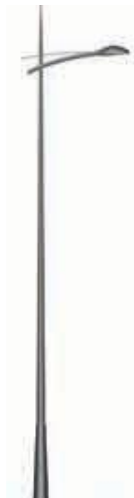
D - Kima 800 Duna bollard