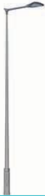
B - Java 800 Dryas bollard