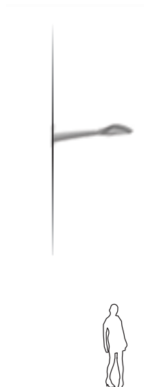
A - Wall mounting