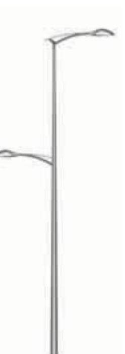
E - Kima 800