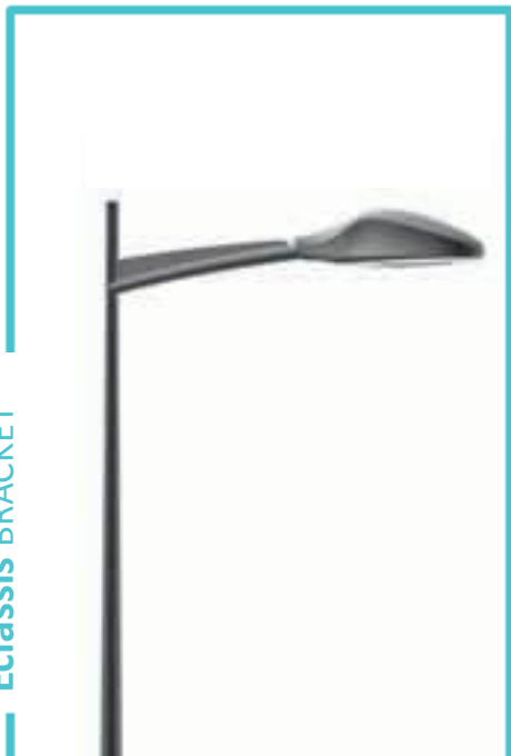
R-Light Suggestions for ensembles