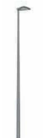
C - Jima 600